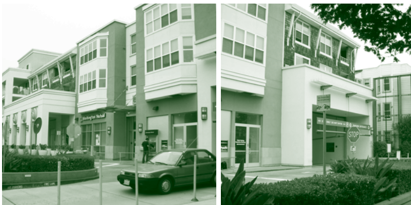
From left to right: Grocery storefront, Retail (bank), parking entrance

Example: Fulton Market, San Francisco, California