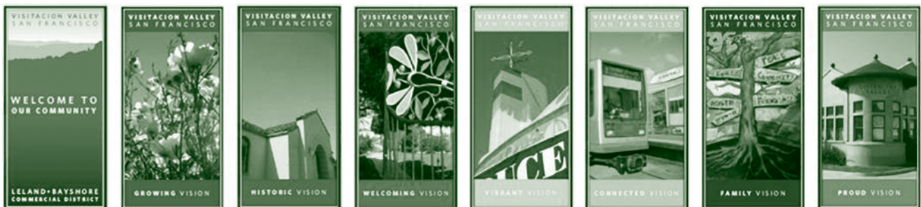
Sample neighborhood identity images from Commercial Corridor Program in San Francisco: Visitacion Valley Business Opportunities & Outreach for Merchants

Community groups can work with the police to improve public safety and reduce crime. If efforts to reduce crime are successful, it is also important to make sure that these positive changes are widely communicated. Community groups can be effective not only in improving safety in the neighborhood, but also in creating positive perceptions about the neighborhood. LISC's Community Safety Initiative ( www.lisc.org/section/areas/sec1/safety ) provides resources and offers trainings for proactively addressing public safety. One such program is the SafeGrowth program, which introduces participants to means of minimizing the physical opportunity for crime and minimizing the site specific social conditions that generate crime opportunities based on Crime Prevention Through Environmental Design (CPTED) principles.