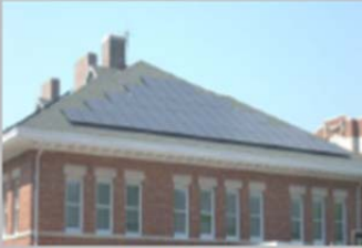
Solar panels installed on Town Hall

Town: Huntington Population: 203,264 Project Size: 28.0 kW Yearly Production: 36,000± kWh