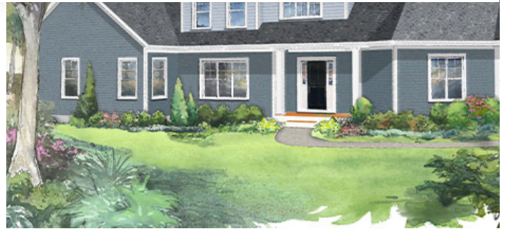
Your Ruby II Twin Home at Redbr