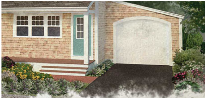
Park One Cottage