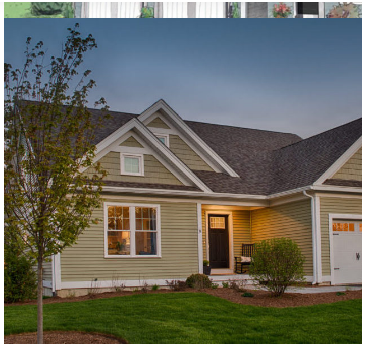
The Laurel – Including 2nd Floor O