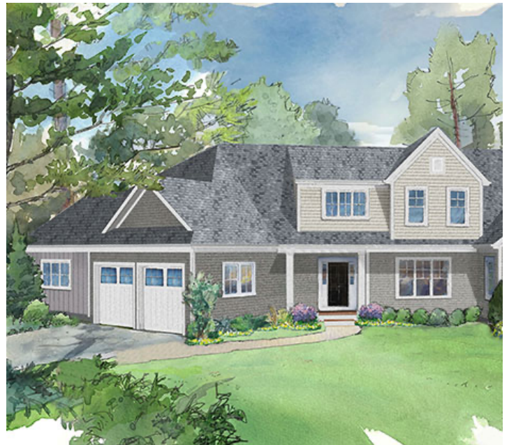
Your Topaz II Twin Home at Redb

We are accepting visitors "By Appointment Only" 508.224.2600