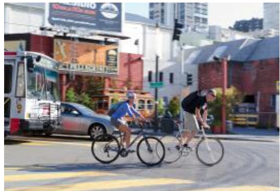
Having safe, secure and conveniently located bike parking can promote more bicycling for commuting and recreation.

Requirements for additional parking for new non-residential development in Downtowns and town centers should be eliminated, wherever feasible, based on local conditions and community plans. The elimination or reduction in city parking minimums will allow developments to proceed with lower levels of parking in the specific situations where developers think these are viable, and will not prevent the construction of new parking where warranted by the market.