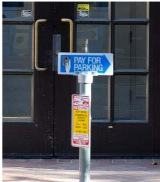
Pricing can help manage parking availability.

As described in the Ten Point Plan overview, pricing is a powerful tool to regulate parking availability and the San Francisco Planning Code is an excellent model of how this can be done. Another example is to have a parking tax. For example, San Francisco's Parking Tax (Article 9 of San Francisco Business and Tax Regulations Code Sections 601 and following) applies to the rental of all non-residential parking spaces in the City. This is true even when a parking space is furnished with rented office space and rent for the parking space is not separately stated in the rental agreement. In such a circumstance the Parking Tax is due on the amount that would have been charged for the parking space if rent for the parking space had been separately stated based on the market rate for rent of parking spaces in the part of the City where the parking space is located. The Parking Tax applies because a building owner or owner's agent who receives rent from a building tenant for the occupancy of a parking space is an operator who must collect and remit the tax from the parking space occupant to the City. Revenues from the Parking Tax are split between the General Fund (20 percent) and the Municipal Transportation Fund (80 percent), the latter financing the City's transit system - Muni.