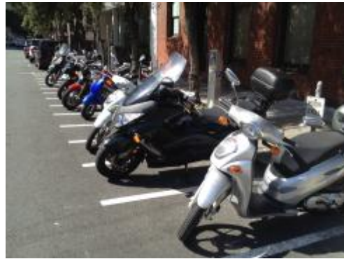
Motorcycle parking spaces need dimensional standards.